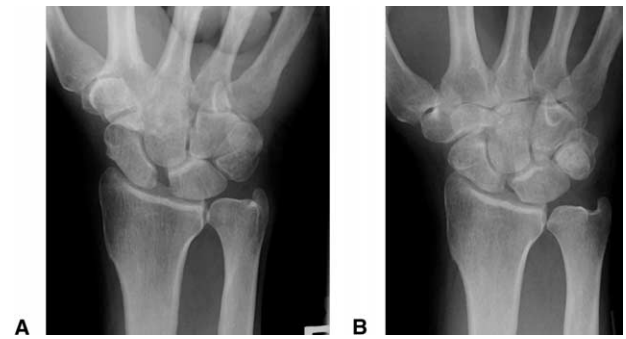
Figure 4. (A) Preoperative PA grip-view radiograph and (B) PA grip-view radiograph at 44 months after surgery of patient 6. Although gapping of the SL interval still can be seen the patient is symptom free and no arthritic changes to the wrist are noted.