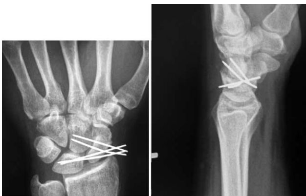
Figure 3. (A) Posteroanterior and (B) lateral radiographs of the same patient as in Figures 1 and 2 (patient 8) showing the placement of 1.4-mm K-wires across the SL and scaphocapitate intervals. Note the absence of a dorsal intercalated segment instability deformity on the lateral radiograph.

using the Student t test to compare the preoperative and postoperative values in patients who did not have additional surgery and differences in patients with Geissler grade III and grade IV tears; p values less than .05 were considered statistically significant.