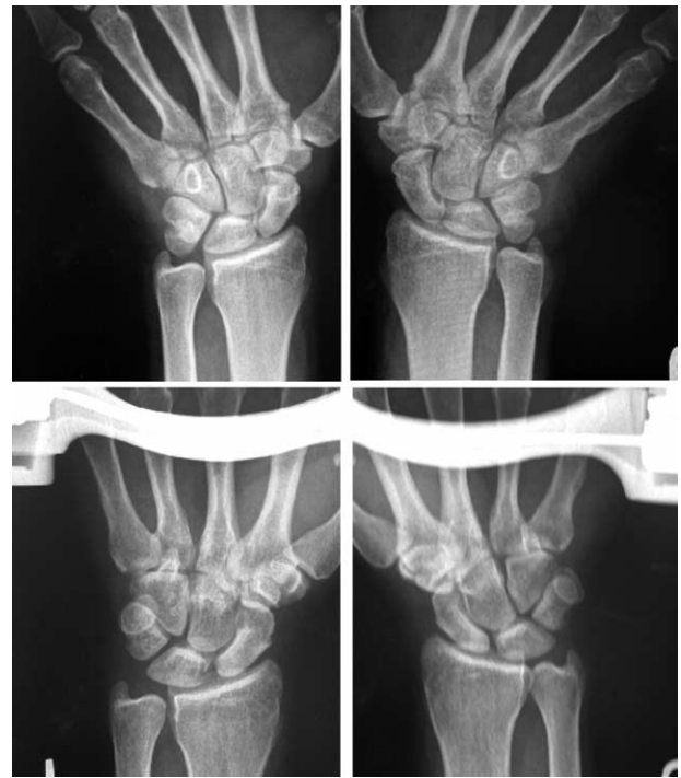
Figure 1. Comparative PA neutral (top) and grip-view (bottom) radiographs of patient 8. The patient is grasping a dynamometer on the grip-view radiographs. Dynamic SL instability is shown on the left wrist with SL interval gapping on the grip-view radiographs compared with the uninvolved right wrist.

Wrist arthroscopy was performed by using a standard technique with the arm supported by a tower distraction device and 4.5 to 6.7 kg of distraction applied to