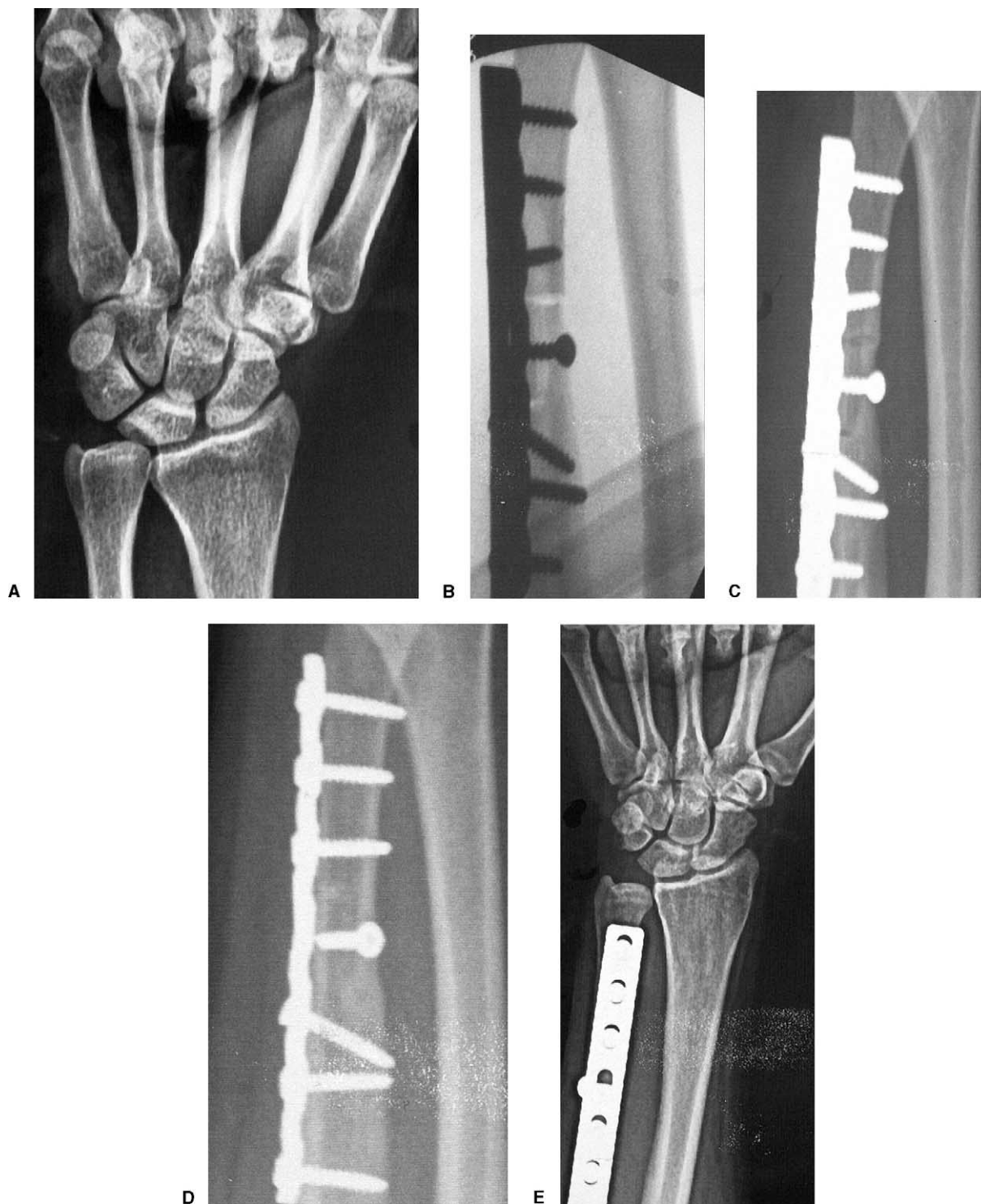
Figure 2. (A) Preoperative pronated grip view radiograph of a patient with ulnocarpal impaction. The cystic kissing lesion at the ulnar side of the lunate can be observed. Progression of healing of the step-cut osteotomy on oblique-view radiographs of the same patient: (B) intraoperative, (C) at 6 weeks, and (D) at 10 weeks. (E) Postoperative pronated grip-view radiographs showing correction of ulnar variance.

nated grip view radiographs. Oblique views were obtained to assess the progression of healing because the plate obstructs the view to the osteotomy site in lateral radiographs obtained in a routine fashion.